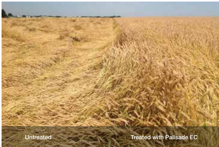
Syngenta trial in Clinton County, Ill.