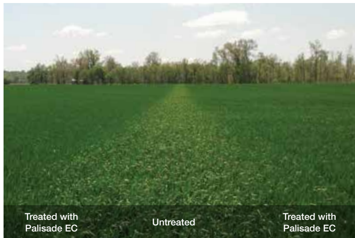
Syngenta trial in Daviess County, Ky.